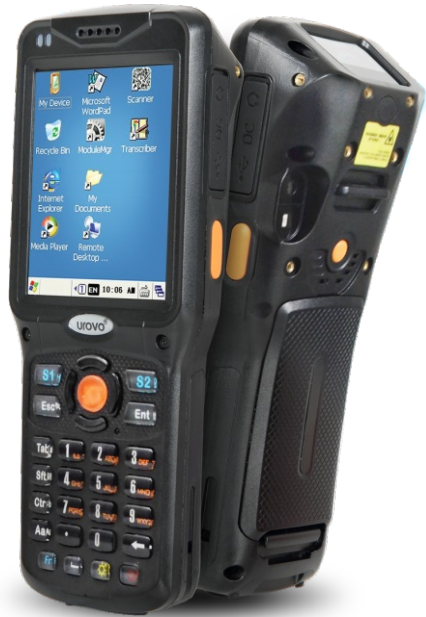
V5100 User Guide