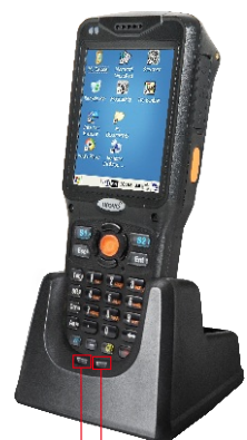
C Indicator P Indicator