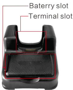
Battery slot Terminal slot